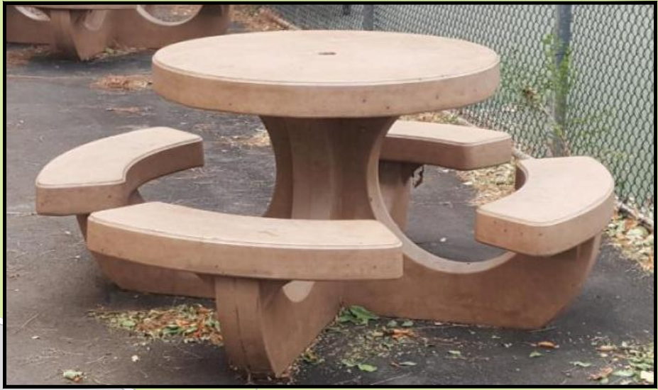
PICNIC BENCH OPTION #3