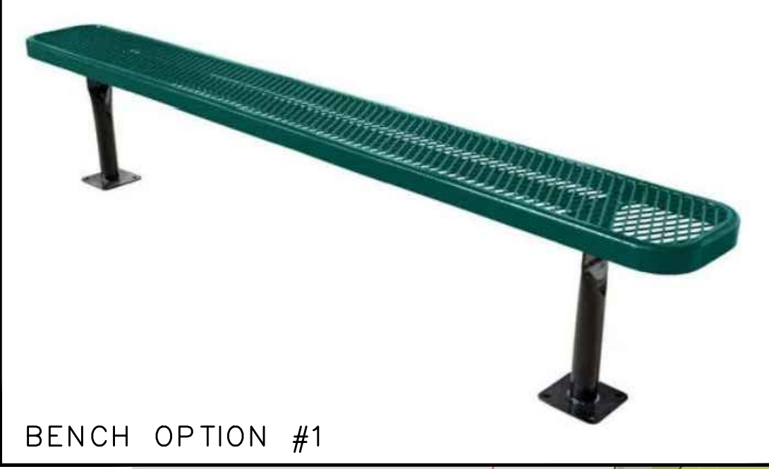
BENCH OPTION #1