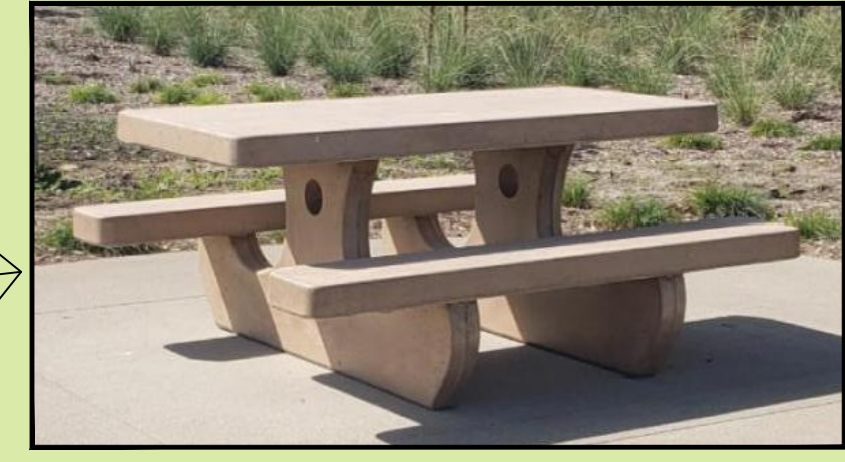
PICNIC BENCH OPTION #2