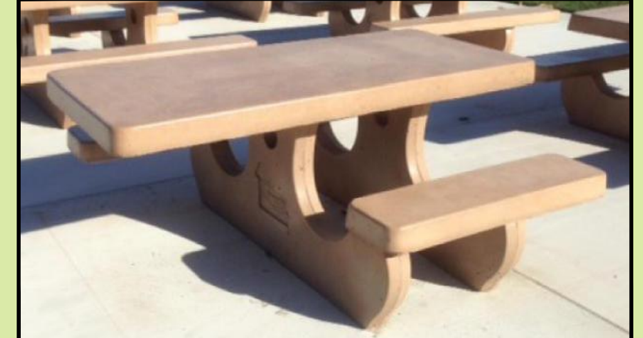
PICNIC BENCH OPTION #1