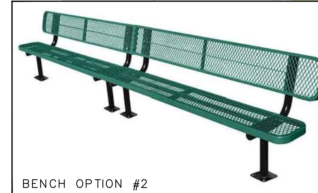
BENCH OPTION #2